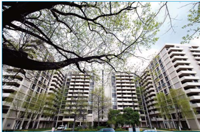
International Style façade.