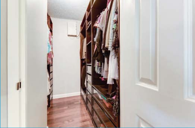
Beautifully outfitted closet!