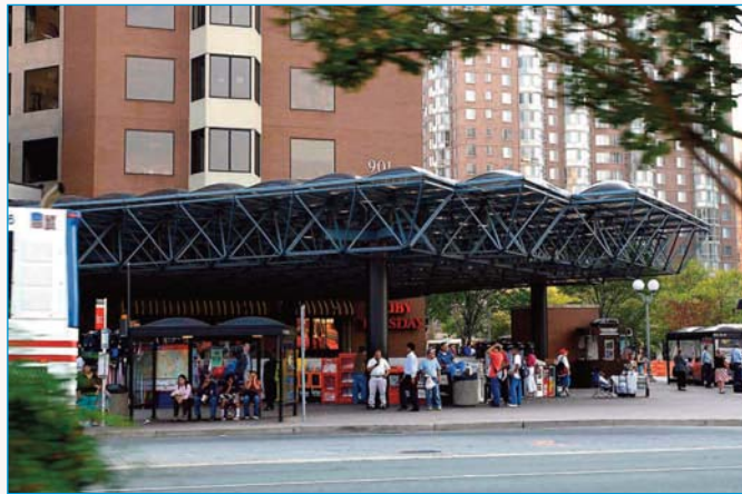
10 minutes to Metro!