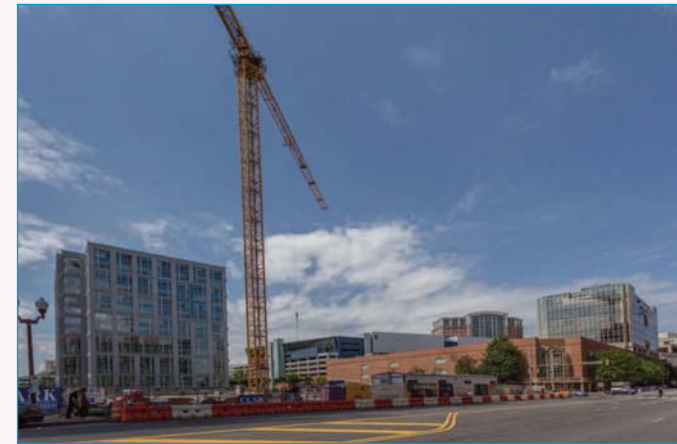
Complete renovation of Ballston Quarter – and a new Target coming to Glebe and Wilson.