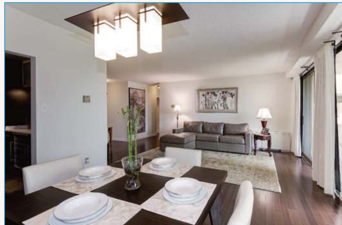
Kitchen on the left, hallway to Bath and Bedroom far left.