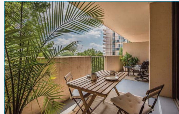
20’ balcony... almost another ‘room.’ Good view.