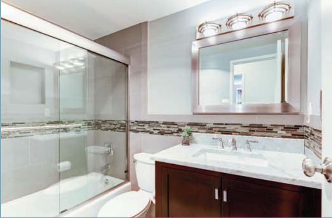
Gorgeous renovated bath.