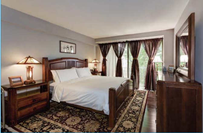
Very large Master Bedroom.