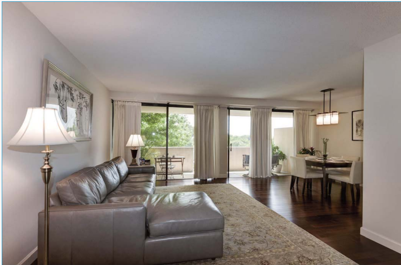
Very Spacious! Wall of windows.

Designed by noted Washington architect Vlastimil Koubek, the Hyde Park is known for quality construction and quiet apartments.