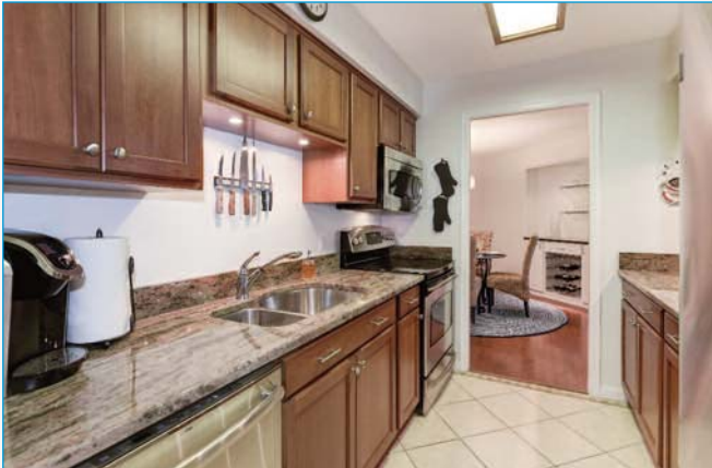
RENOVATED KITCHEN TOWARD DINING ROOM