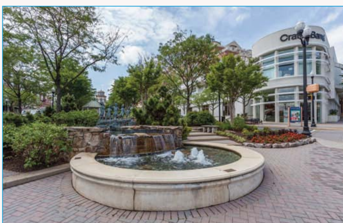
MARKET COMMON SHOPPING NEARBY