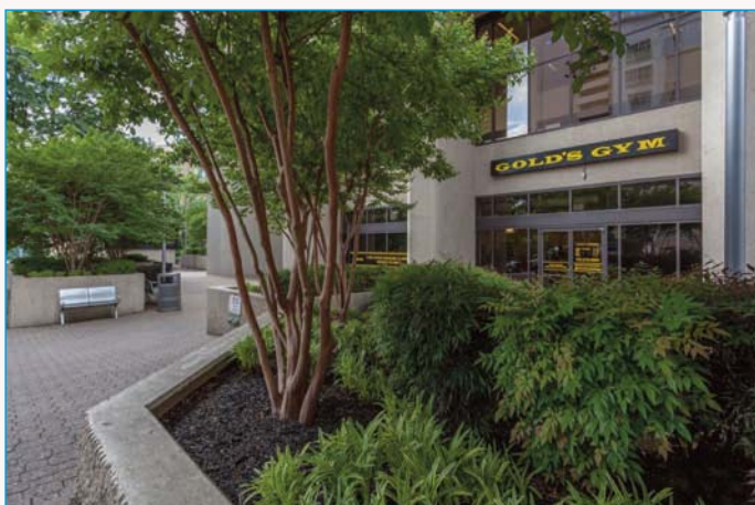
GOLD'S GYM JUST ACROSS THE STREET