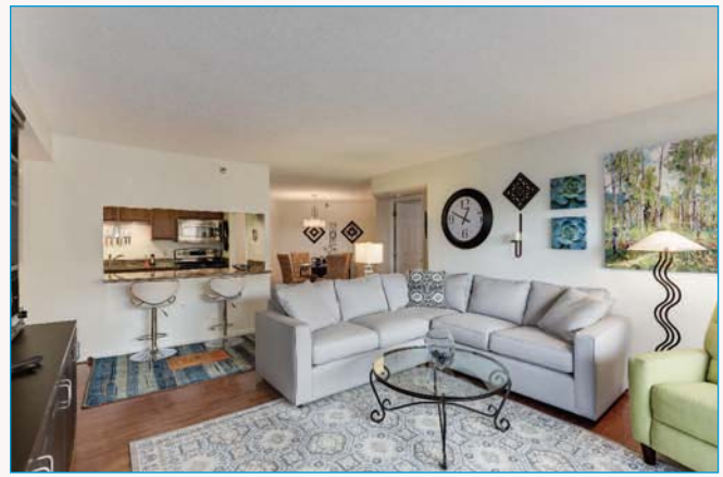
LOOKING TOWARD DINING ROOM AND KITCHEN