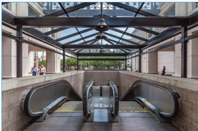
TWO BLOCKS TO METRO ESCALATOR