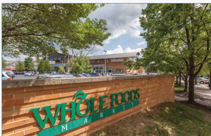
WHOLE FOODS AND TRADER JOE'S NEARBY