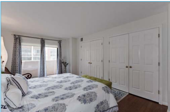
MASTER BEDROOM WITH GREAT CLOSET SPACE AND DOOR TO BALCONY